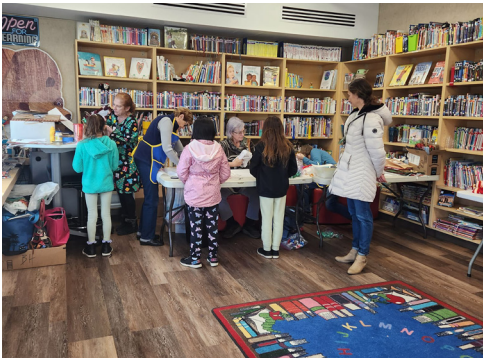
Bell Hill Boutique