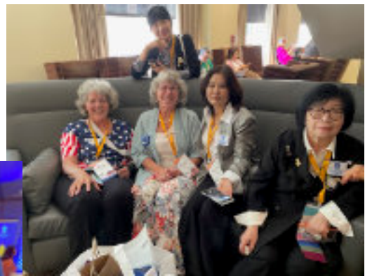
SIA Clubs Phillippines and Korea