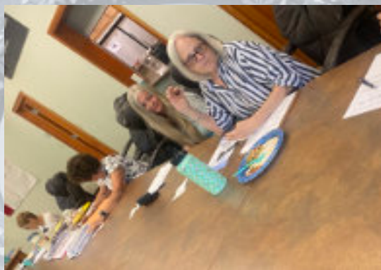
Club Members and Potential Members