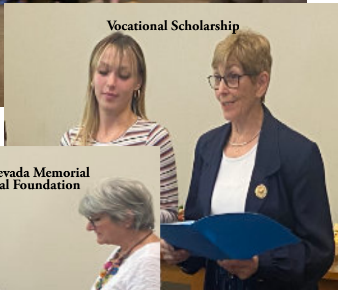
Sierra Nevada Memorial Hospital Foundation