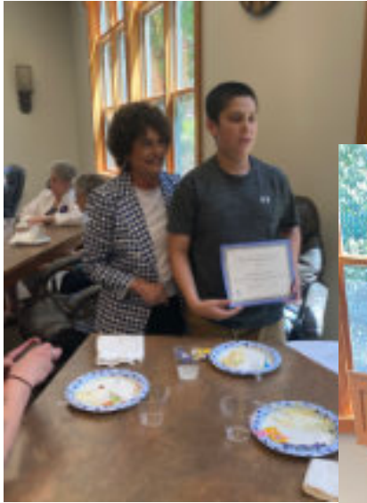
8th Grade Recipients from Lyman Gilmore and Magnolia Schools