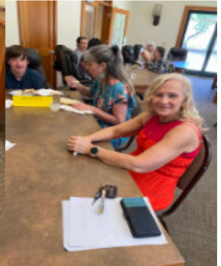
Below: Some of our Members in Attendance